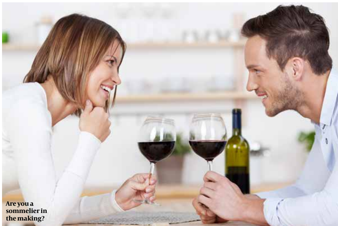
Are you a sommelier in the making?

"People are now so much more interested in wine; it's become a talking point at the Shabbat table. People are swapping tips on which wine to buy and asking 'have you tasted this new wine?'. The Refined Wine Club